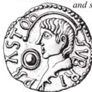
Silver unit of Esuprastus, husband of Boudica?

ABC reviews and revises tribal groups that issued coins, introduces new groups, identifies main centres and suggests mint sites.