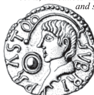
Silver unit of Esuprasto, husband of Boudica?

ABC reviews and revises tribal groups that issued coins, introduces new groups, identifies main centres and suggests mint sites.