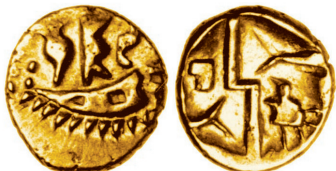
Duro Boat gold quarter stater [ABC 2205] with mythic sun-bolt, thunderbolt, lightning, sky-hammer and long-legged sea bird.