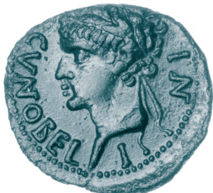
Bronze unit of Cunobelinus [ABC 2957] with Tiberian head. Found near Ware, Herts., 1973.