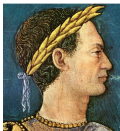
Caesar 'Butcher of Brittany' killed a million Gauls and enslaved a million others