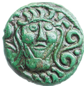
Did druids like this influence the design of Coriosolite coins?