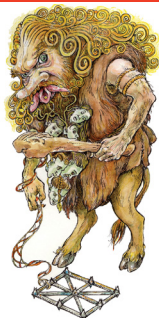
Corsolt got his name from the Coriosolites