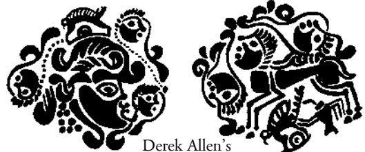
Derek Allen's reconstruction

1. Head and Boar. Osismii. c.80-50 BC. AR stater. 20-22mm. 6.52g. Celtic head r, with boar-standard above and small severed heads attached./ Human-headed horse galloping l, small severed head in front and above, boar-standard below. LT 6541, de Jersey Armorica , p.86, fig. 44. Gd VF, toned silver, strange head and androcephalous horse, severed heads clearly visible. Ex C Byron coll, bt. CR (2004), ex Antony McCammon coll, ex Baldwin's Auction.20, 11 October 1999, lot 46. R £650