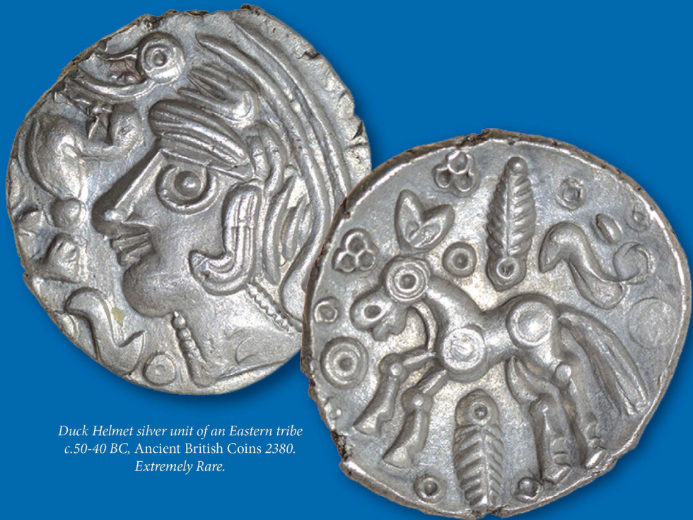
Duck Helmet silver unit of an Eastern tribe c.50-40 BC, Ancient British Coins 2380. Extremely Rare.